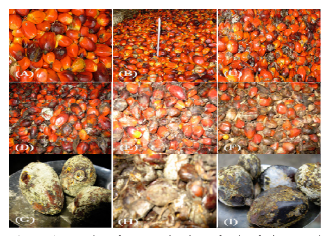
Figure 1. Levels of contamination of palm fruits stored for 26 days. (A) 0 days, fresh fruits (B) 3 days, (C) 6 days, (D) 9 days, (E) 12 days, (F) 19 days, (G) 19 days, (H) 26 days, (I) 26 days.

moisture and impurity contents determined.